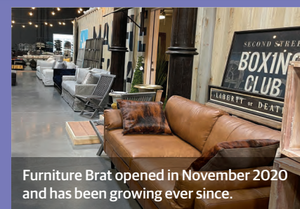
Furniture Brat opened in November 2020 and has been growing ever since.

"I love things that have a story," she said. "If it's authentic, if it's inspiring or if it's funny, I want it in my store."