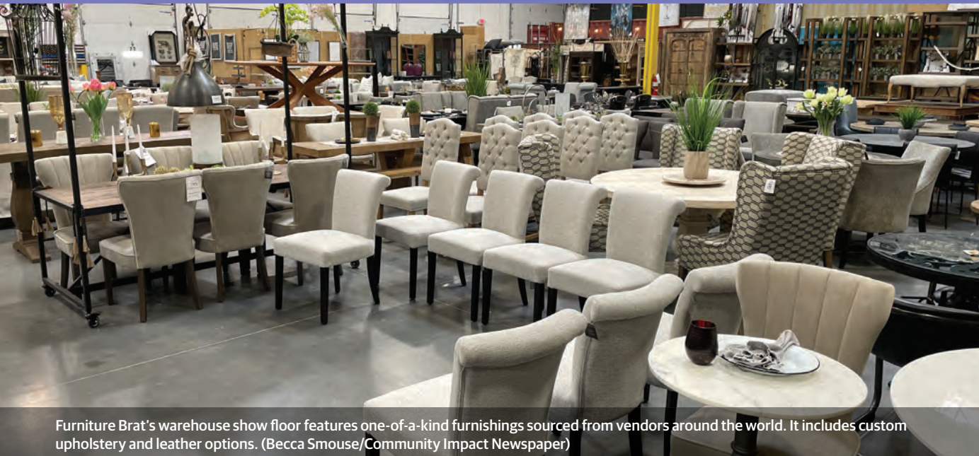
Furniture Brat's warehouse show floor features one-of-a-kind furnishings sourced from vendors around the world. It includes custom upholstery and leather options.